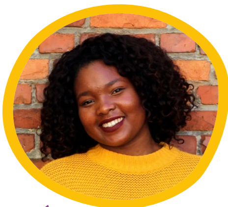
ANA AUA SÓ

Our commitment to end FGM in Europe and beyond would be incomplete and unsustainable without mobilising, preparing and working alongside the next generation of activists for the tasks ahead. End FGM EU believes that children and young people have a unique perspective and potential to drive this change , if they are educated and/or empowered to play their role in promoting and protecting the rights of women and girls. To this aim, End FGM EU embraces young people from FGM-affected communities as core partners in ending FGM and we are actively working towards a youth centred approach. To this aim, we started in 2017 a Youth Ambassadors' programme, which is a safe place where young people from different EU countries can come together, make connections, share experiences with each other and contribute to the work of the Network.