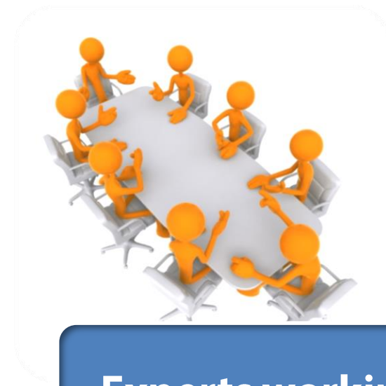
Experts working meetings