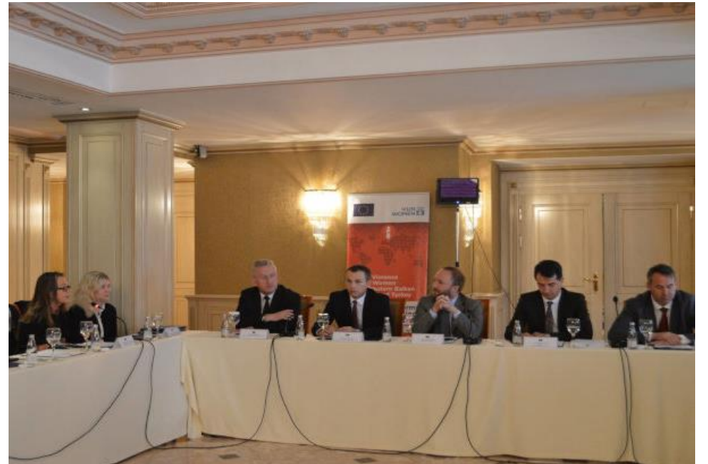
Photo from the ceremony of signing MoU/April 2019