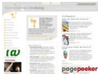
Gender Balance in Research, NO