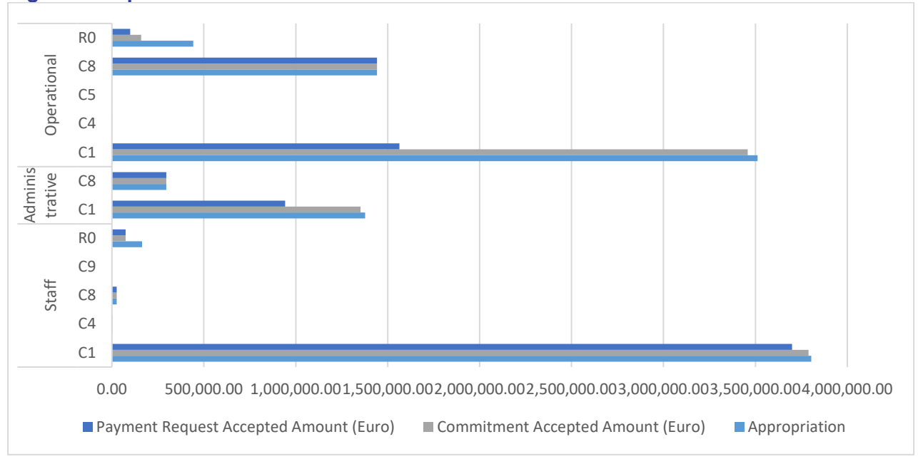
Figure 2. Expenditure in 2021

Expenditure in 2021 amounted to EUR 8 146 070.65 (EUR 7 149 867.7 in 2020), of which EUR 3 802 401 was in Title I (EUR 3 589 231.94 in 2020), EUR 1 238 457.62 was in Title II (EUR 1 163 903.69 in 2020) and EUR 3 105 212.03 was in Title III (EUR 2 396 732.07 in 2020) (see Figure 2 below).