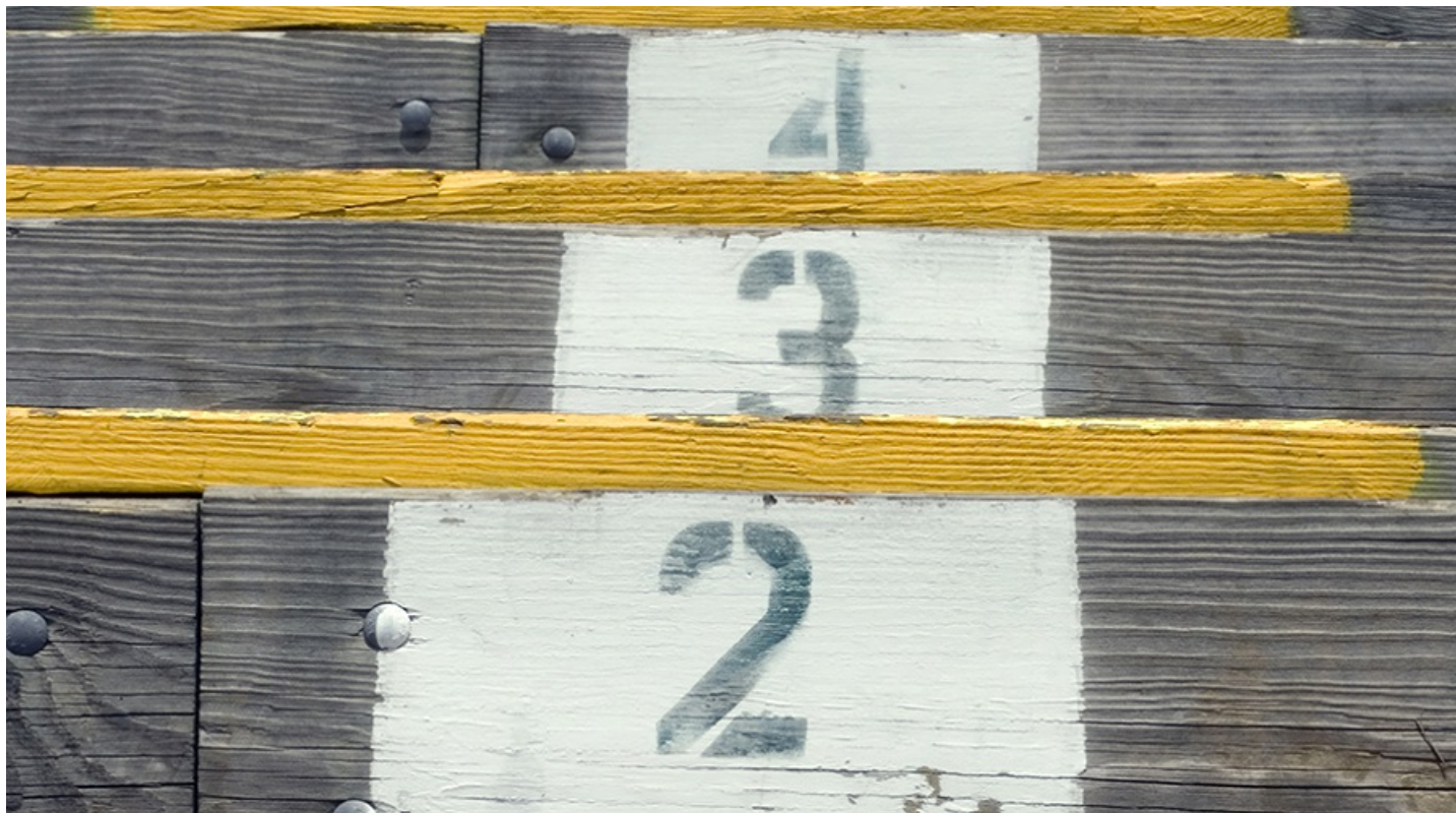
Gender equality training