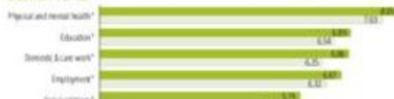
Figure 2. What do health services and medical centres enable you to do? on an ascending scale of importance from 1 to 10.

Trends regarding other public infrastructure demonstrated gendered trends. For example, women emphasised the importance of nurseries, because they enable women's participation in paid work, while men highlighted the importance of pavements and footpaths for morning strolls, and parks and other green areas for leisure time activities that support well-being.