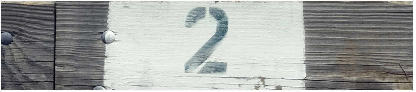
Gender equality training