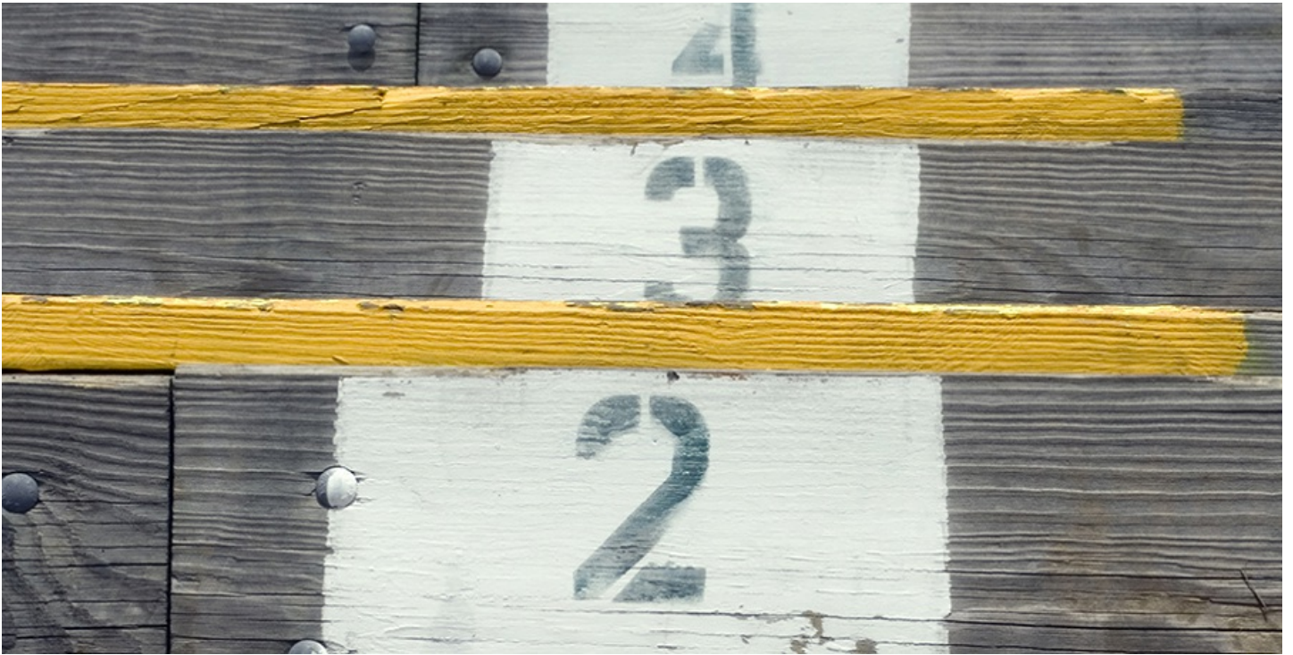
Gender equality training