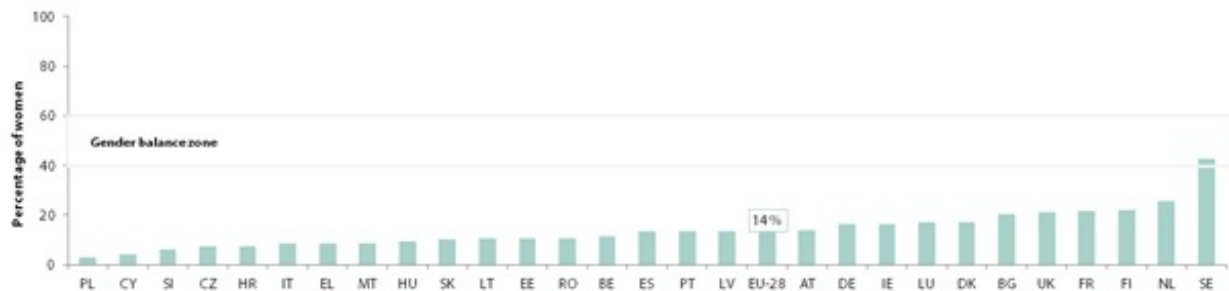
Figure 1 Proportion of women among all decision-making positions in national sport federations in the EU-28, 2015