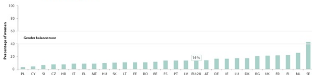
Figure 1 Proportion of women among all decision-making positions in national sport federations in the EU-28, 2015

Source: Data were collected from the 10 popular national sport federations in all 28 Member States (280 in total), between May and June 2015.