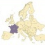
Figure 10: Overview

The study is structured as follows: Chapter 1 provides an overview of the study, including the objectives, methodology, and data sources. Chapter 2 presents the findings of the study, including the results of the surveys and interviews. Chapter 3 discusses the implications of the findings for policy and practice. Chapter 4 provides conclusions and recommendations.