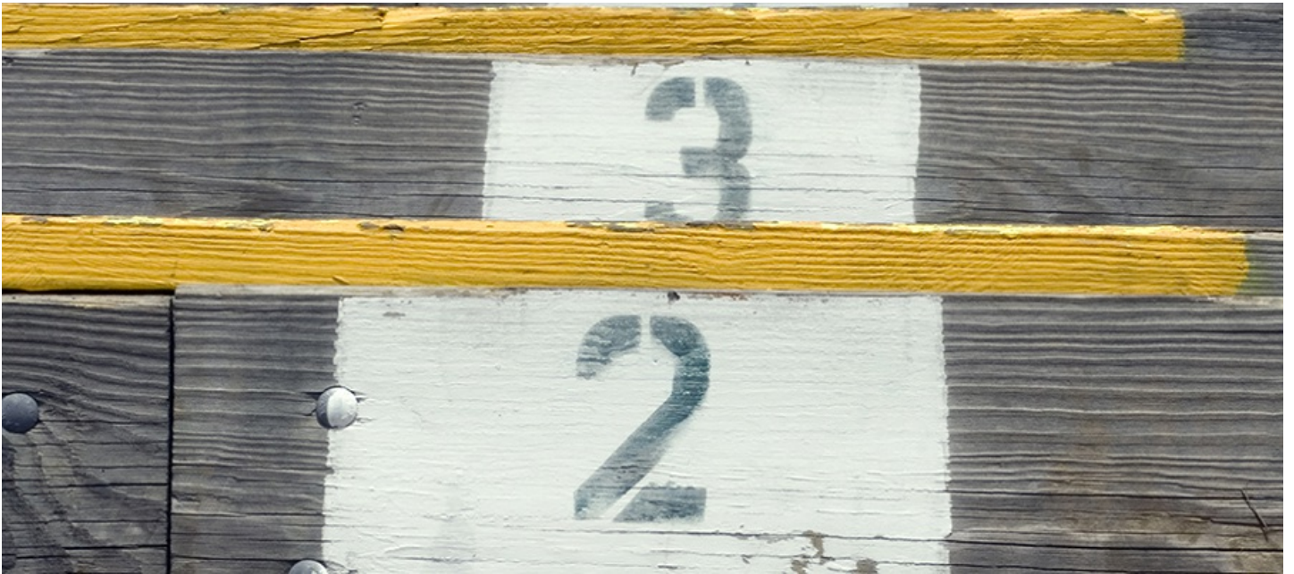
Gender equality training