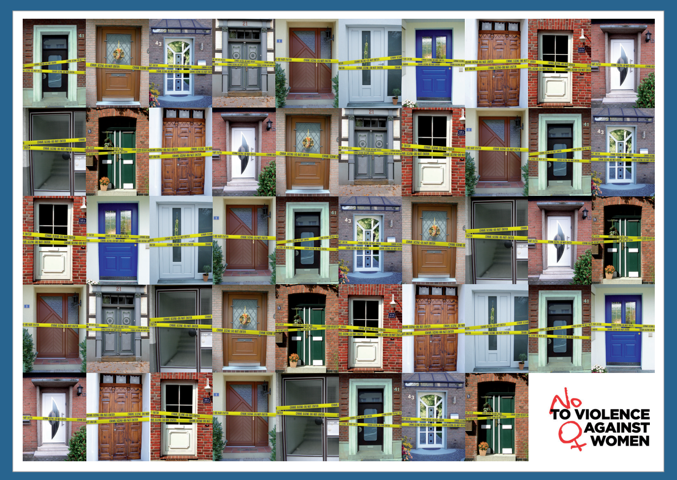
© United Nations Regional Information Centre (UNRIC) for Western Europe 2011 European advertising competition, 'No to Violence Against Women', Ralph Burkhardt