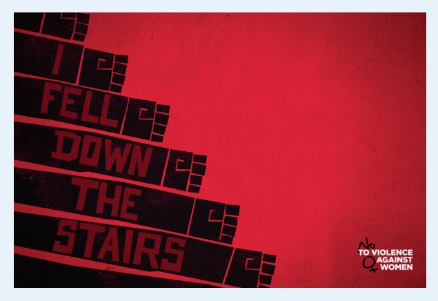
© United Nations Regional Information Centre (UNRIC) for Western Europe 2011 European advertising competition, 'No to Violence Against Women', Brune Buonomano

No comparable and harmonised data are available at the EU level and it is therefore not possible to calculate a score for the domain of violence. This is flagged as the largest gap in measuring gender equality in the EU, calling all policymakers at EU and Member State levels to ensure the collection of comparable data , to effectively support the efforts to end gender-based violence.